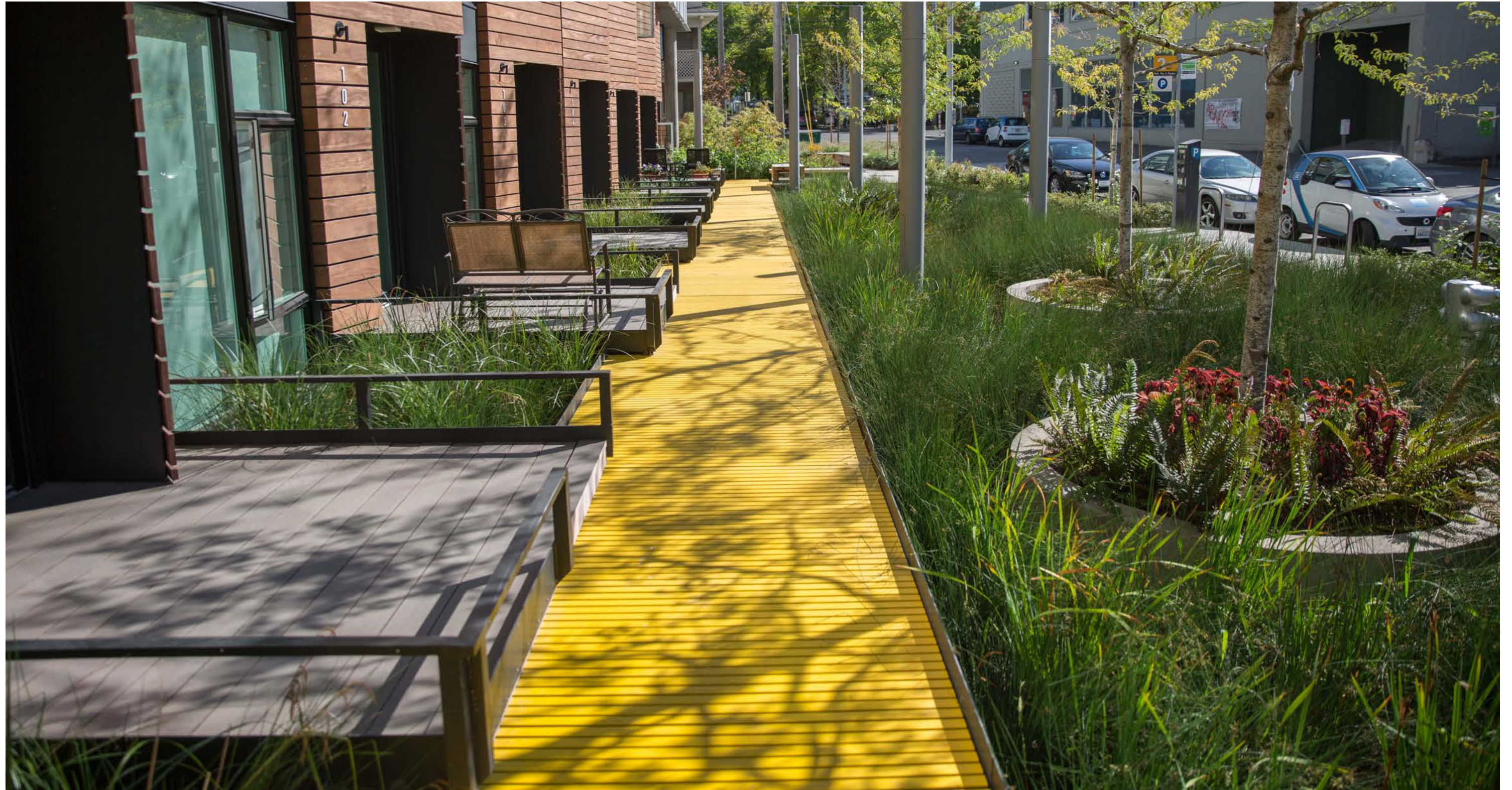
Rain garden and planters invite interest rain or shine.