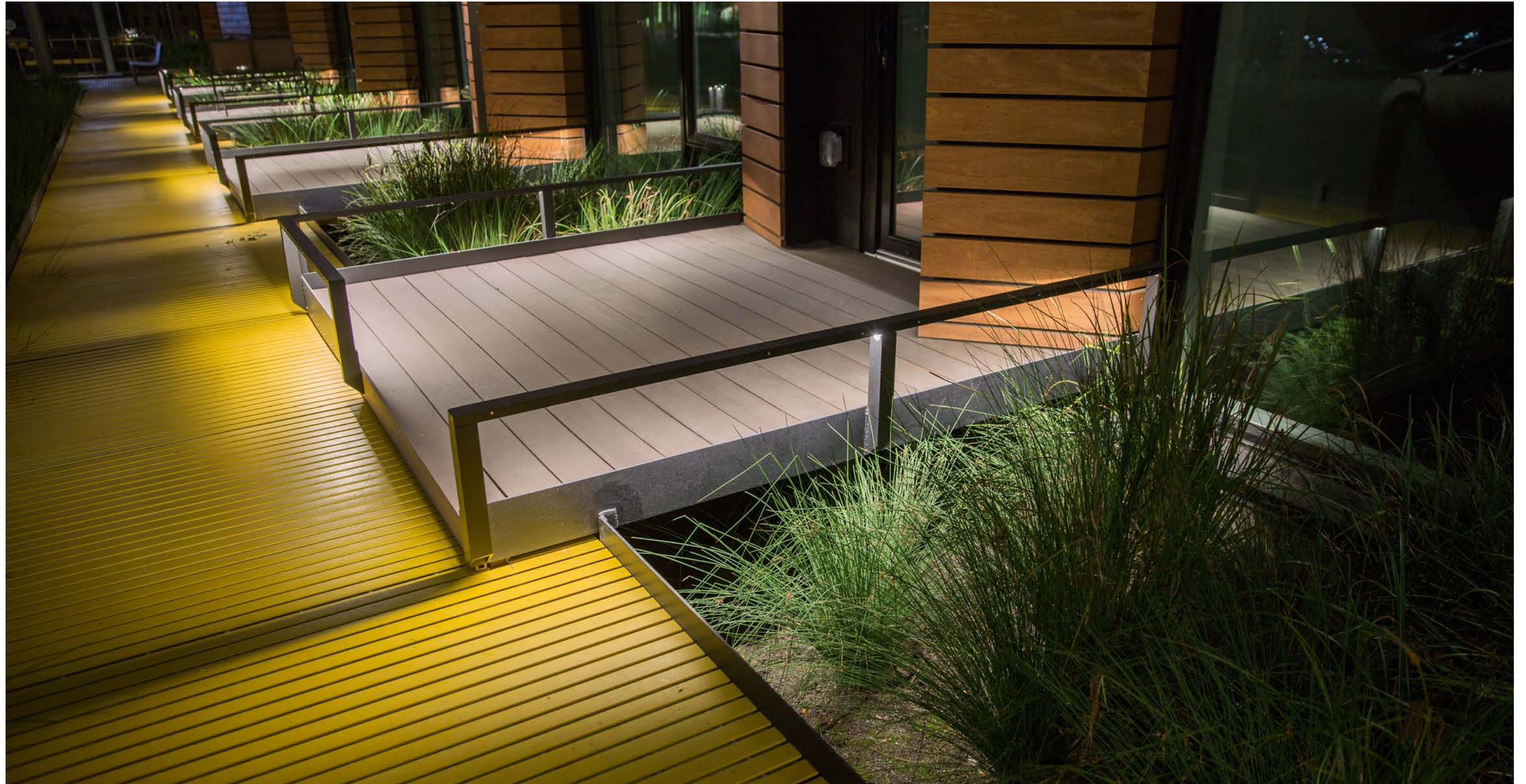
Small private landings provide area for patio seating and connect to the “mega stoop.”