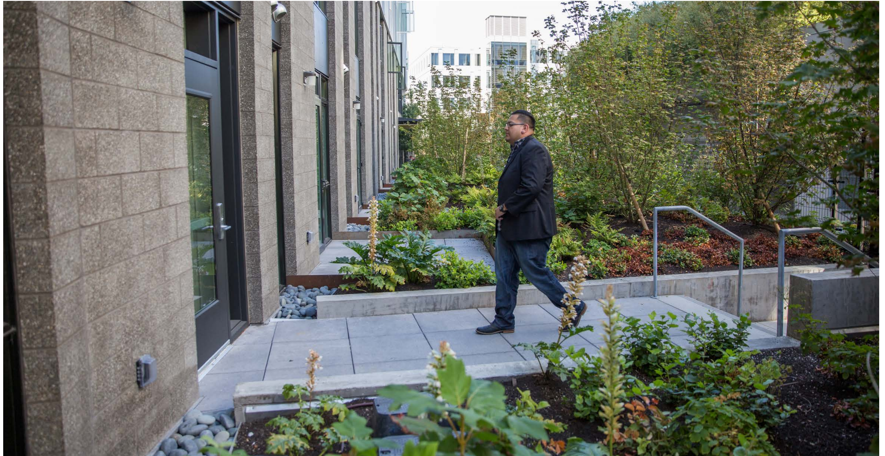
Alley terraces, landscaped with a rich palette of indigeneous plant material gives urban respite for the at-grade units as well as a generous gesture to neighboring properties.