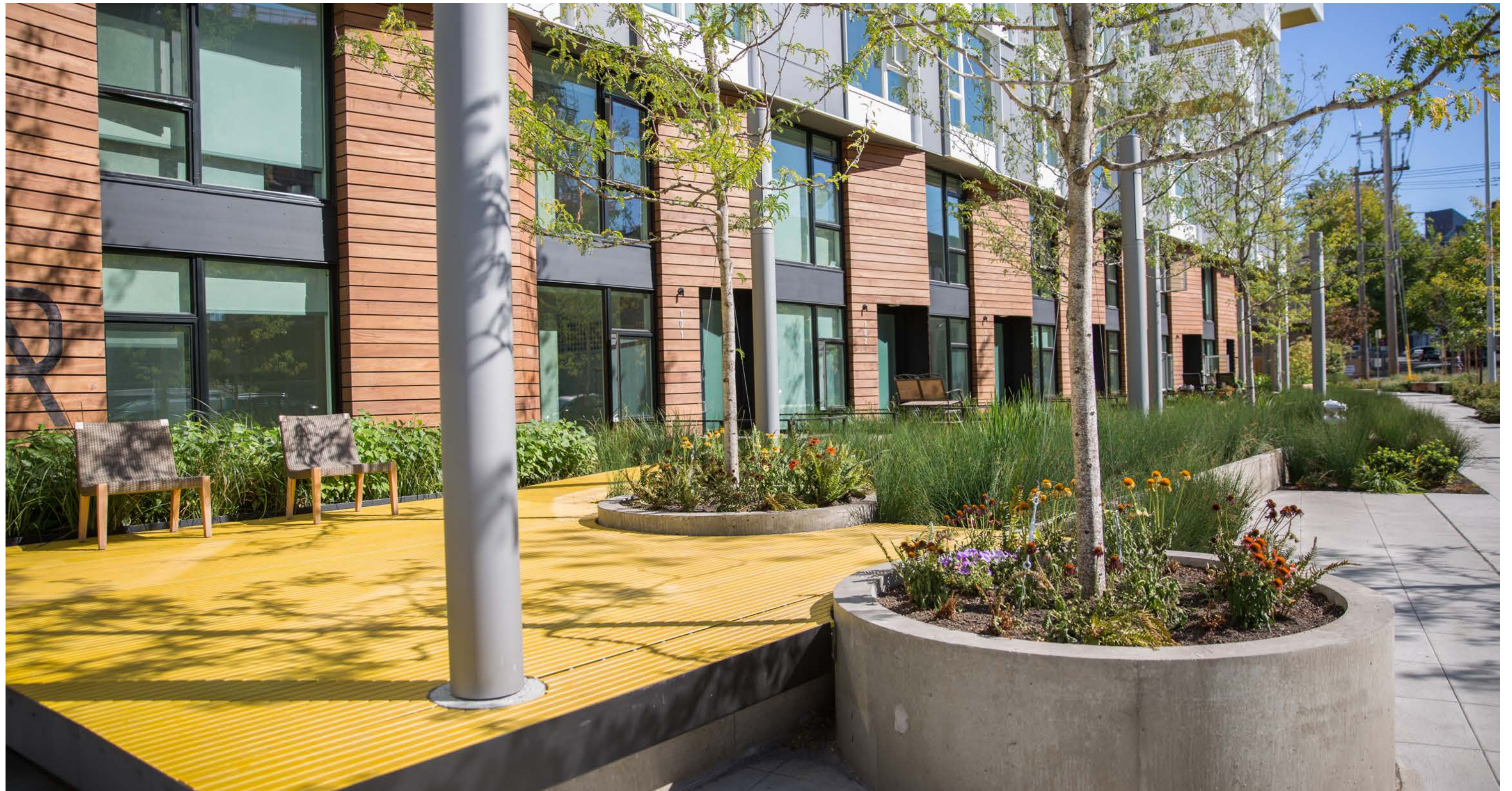
The “mega stoop” is a yellow fiberglass boardwalk over recessed rain gardens that serves as outdoor area for the residents and provides a visual anchor at the building entry.