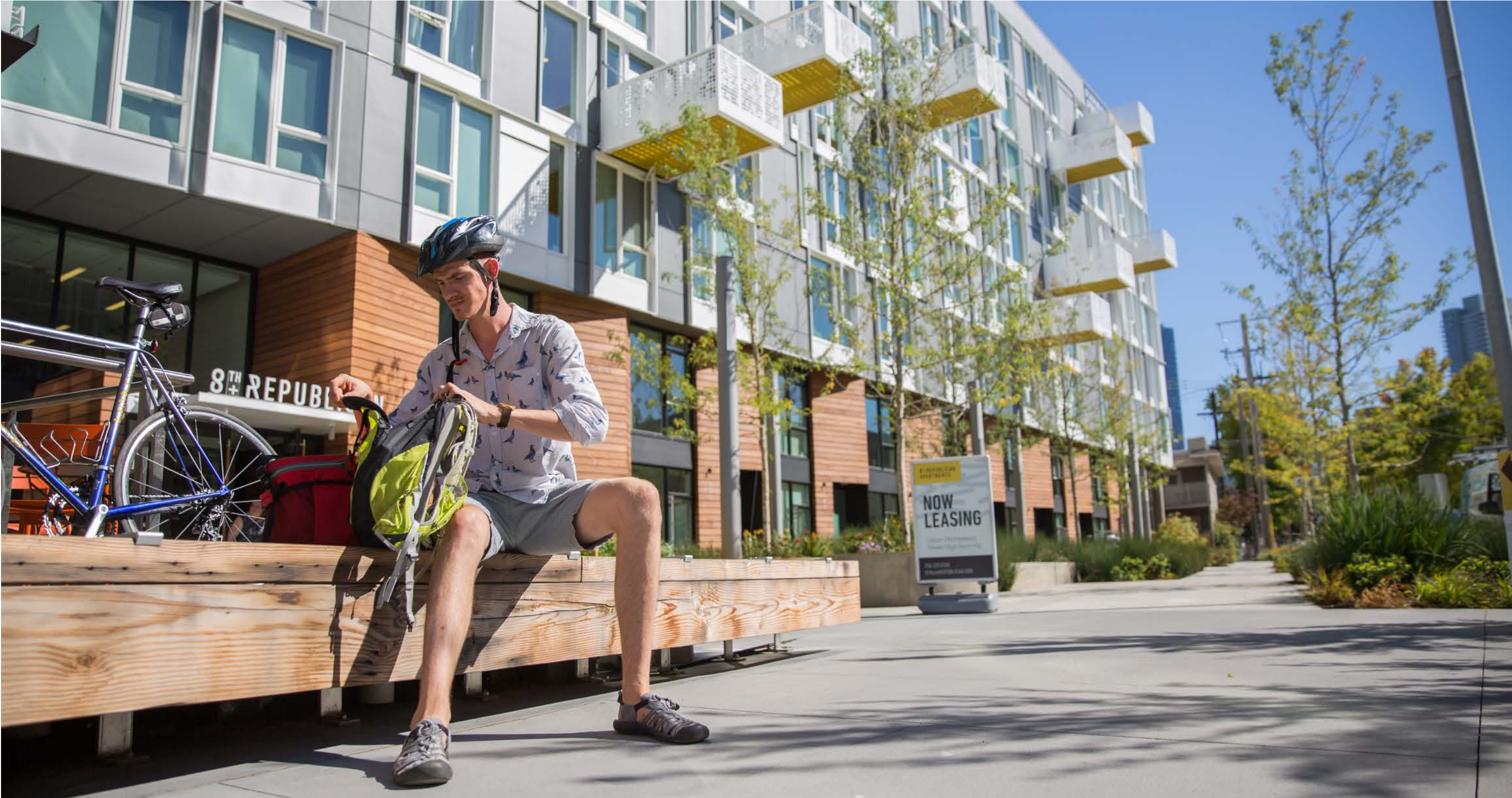
Reclaimed timber benches provide accessible seating for public use and harmonize with the first level building facade for a unified sense of place.