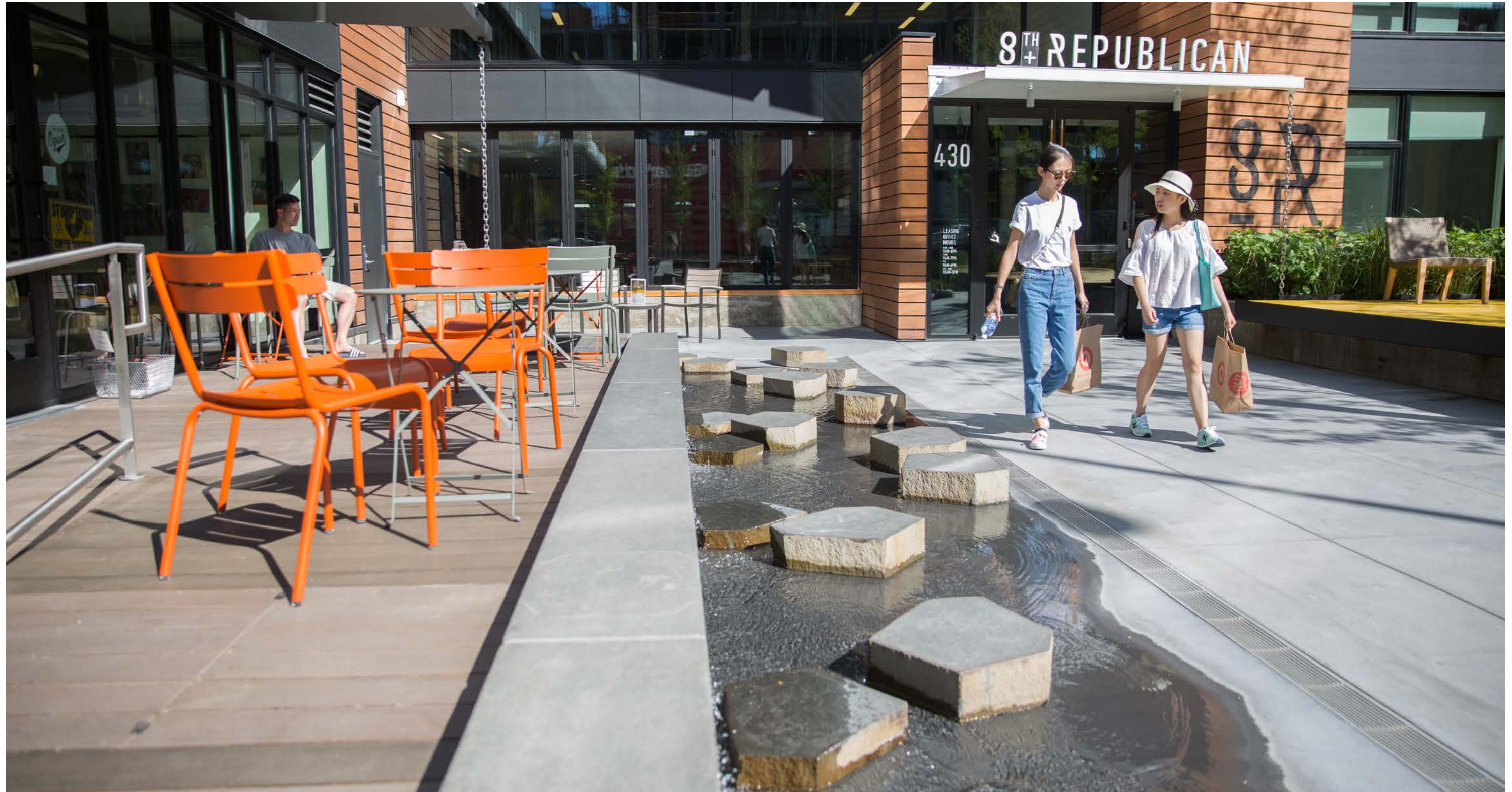
A sidewalk parallel to the “mega stoop” allows the public to access the building’s front entry and ground floor retail. The low water feature adds a dynamic element of delight with stepping stones and elevated deck populated by café seating.